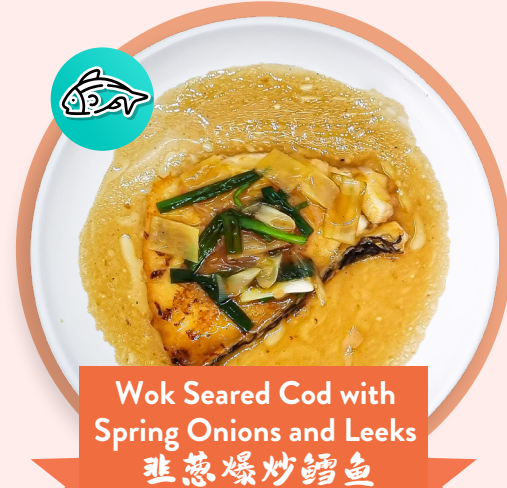
Wok Seared Cod with Spring Onions and Leeks 韭蔥爆炒鱈魚