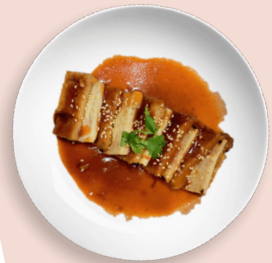
客家芋头猪扒 Hakka Braised Pork with Yam