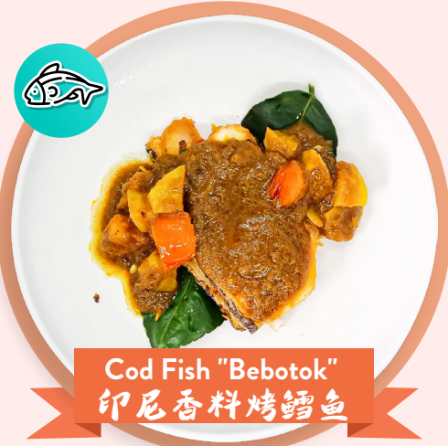
Cod Fish "Bebotok" 印尼香料烤鱈魚