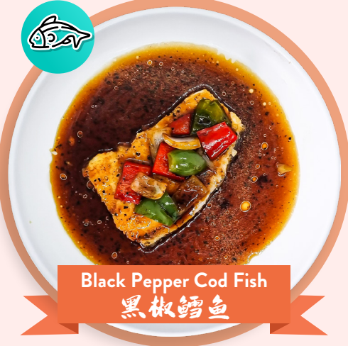
Black Pepper Cod Fish 黑椒鱈魚