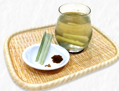
Lemongrass Fenugreek Drink