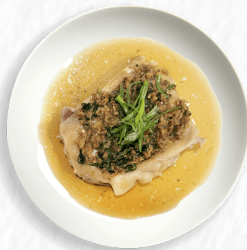
Braised Chicken with Ginger and Coriander Sauce