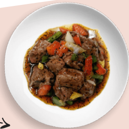
黑椒牛肉 Black Pepper Wagyu Beef