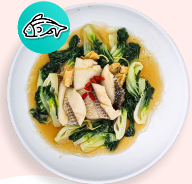
Stir Fried Nai Bai with Fish Slices and Shredded Ginger 姜丝鱼片奶白