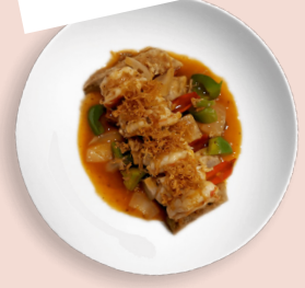
XO 酱鲜芋炒虾 XO Sea Prawn with Yam