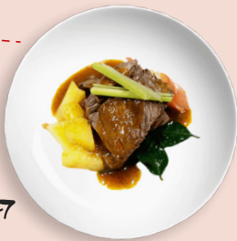
植物肉椰香仁当 (素) Plant-based Rendang Lemak with Coconut Flakes (Veg)