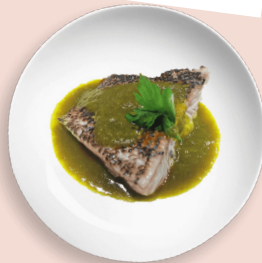
芹香鱼片 Fish Fillet with Celery Sauce