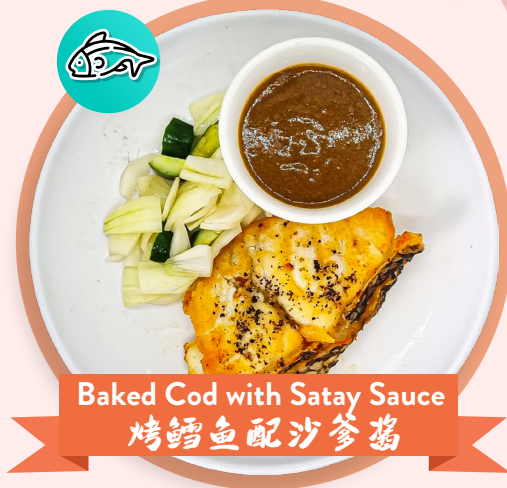
Baked Cod with Satay Sauce 烤鱈魚配沙爹醬