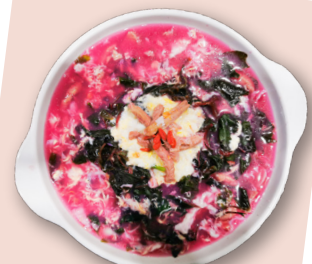
红苋菜蛋花肉丝汤 Red Amaranth Soup with Egg White and Pork Strips