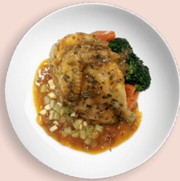
摩洛哥式炖鸡 Moroccan Chicken Stew