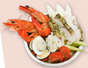
茴香海鲜汤 Fennel Seafood Soup

Our traditional variety preserves the classic, homely feelings you get when you are served with foods from your kitchen. Meanwhile, our fusion dishes bring you fresh tasty flavours, creating a more exciting recovery period!