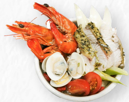
Fennel Seafood Soup