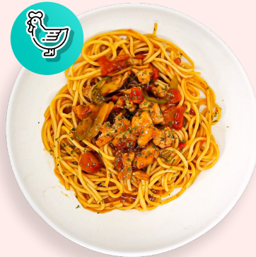
Chicken Spaghetti Bolognese 番茄鸡丁意粉