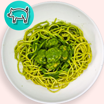
Basil Pesto Pasta with Meatballs 猪肉丸丸层塔意粉