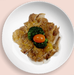
香柚蜜汁鸡扒 Yuzu Honey Chicken