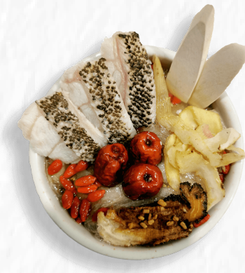
Fenugreek Fish Soup